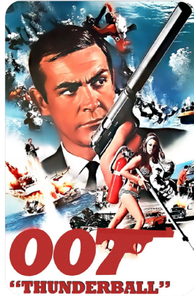
"THUNDERBALL" JUNE 5 THUNDERBALL