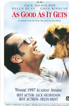
JUNE 26 AS GOOD AS IT GETS