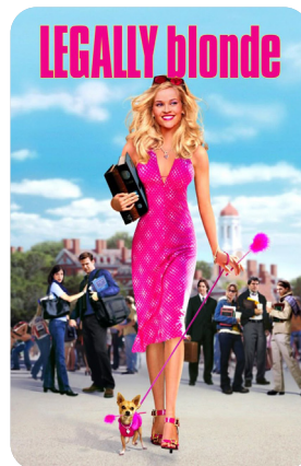
JUNE 19 LEGALLY BLONDE