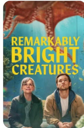
JUNE 12 REMARKABLY BRIGHT CREATURES